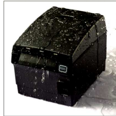
IPX2 class certified