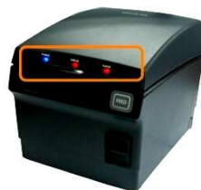
High-gloss front panel with three LEDs

BIXOLON SRP-F310 is designed in a pentagon shape with separate angles for the control panel unlike existing front exit type receipt printers. This ergonomic design allows users to check the printer status more conveniently and eliminates the need to open a drawer to check the status for those who keep the printer in a drawer.