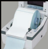
Peeler and Dispenser